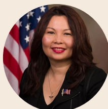
TAMMY DUCKWORTH, U.S. SENATOR-IL