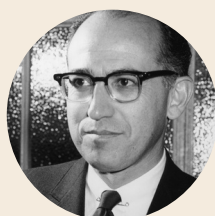
JONAS SALK, DEVELOPER OF POLIO VACCINE